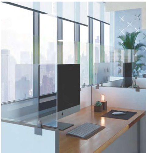
Clear Acrylic Cubicle Wall Extension