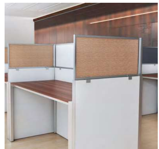
Acoustical Fabric Cubicle Wall Extension