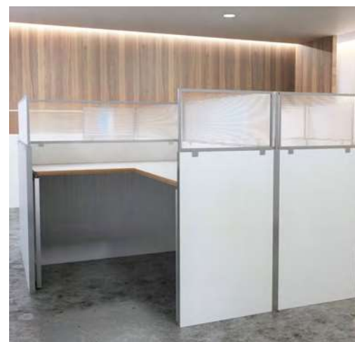
Translucent Polycarbonate Cubicle Wall Extension