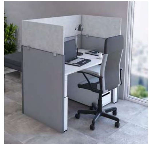
Polyester Acoustical "PET" Cubicle Wall Extension