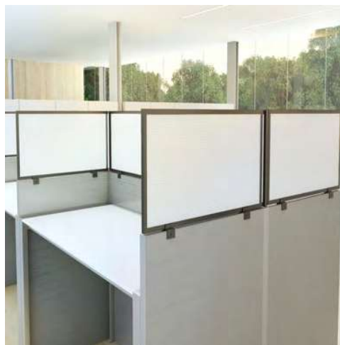
White Polycarbonate Cubicle Wall Extension